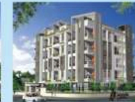
VARDHMAN ENCLAVE, Ajmer Road