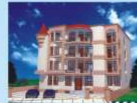
DHANSHREE APARTMENTS, Sanipark