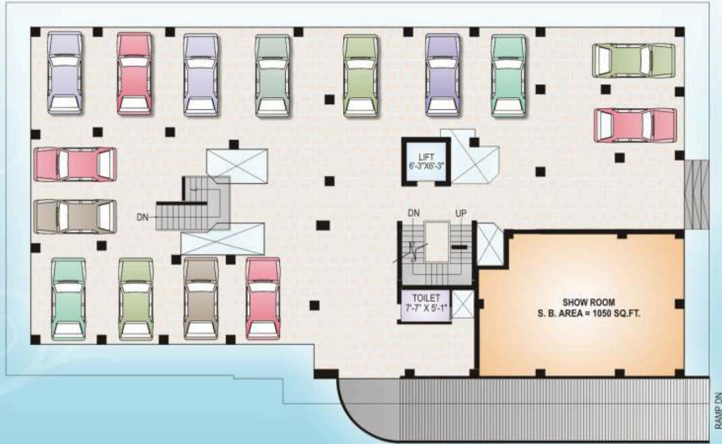
Stilt Floor Plan