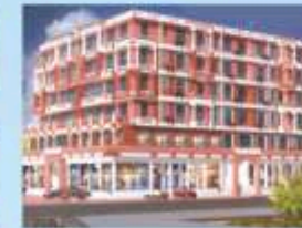
GALAXY PLAZA, Vidhyadhar Nagar