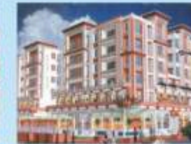
GALAXY STAR, Vidhyadhar Nagar