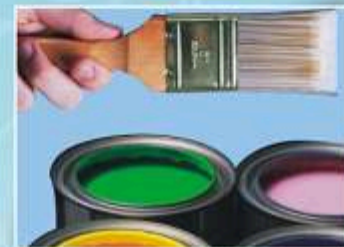
Paint & Polish