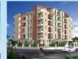
VARDHMAN RESIDENCY, Ajmer Road