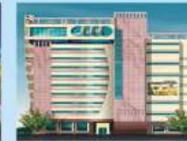
STATUS METRO MALL, Shyam Nagar